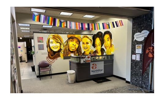
NorthStar Youth Outreach Center at Maplewood Mall

M-TH 8 a.m. to 5 p.m. F 8 a.m. to 3 p.m.