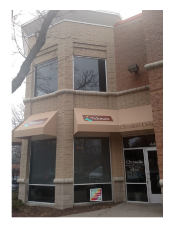
Tubman Chrysalis Center

4432 Chicago Avenue South Minneapolis, MN 55407