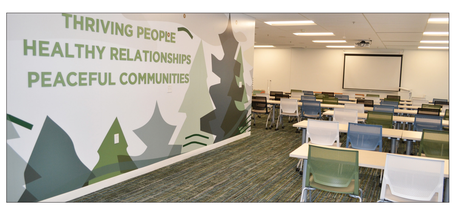
By investing in our buildings, we are better able to create spaces that showcase our values, are trauma-informed and client-centered, and help our staff do their best work. These new spaces welcome everyone who comes to Tubman for help.